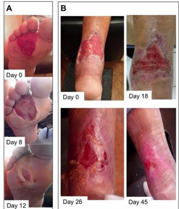
Figure 2. Chronological evolution of the lesion of diabetic foot ulcers classified as Wagner grade II, treated with topical administration of AgNPs. DFU from (A) 46 years-old male patient with type-2 diabetes and (B) 40 years-old male patient with type-2 diabetes. In both figures (A and B) initial appearance of the ulcer is shown and the evolution of the DFU after several days of treatment with AgNPs solution.

diminishment of the lesion extent is noticeable. An evident improvement of the coping is observed along the edges of the DFU while granulation tissue is depicted at the center of the ulcer. Indeed, the central zone of the ulcer shows a diminishment of its diameter with an evident improvement in the pigmentation that confirms the imminent re-epithelialization process with active edges that favoring closure of the injury.